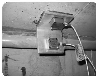
Corrosion sensor embedded in a concrete structure

Use of traditional corrosion sensors are still applied, even though there are modern sensing techniques. The simplest traditional corrosion monitoring technique is the use of sacrificial anodes placed at different depths. This is commonly used for corrosion monitoring of reinforced concrete structures, where anodes are externally connected to a suitable cathode and the currents generated are monitored. Ion meters or ion sensitive electrodes placed in the surrounding area of a metallic object is another type of simple and conventional corrosion monitoring technique. Oxygen transport technique which involves the determination of the rate of oxygen transfer on the object is another important sensing technique. Humidity sensors are a different type of traditional sensor which measures the humidity of an environment in which a metal is corroded. In most cases, these traditional corrosion sensors are used to detect corrosion of metal bars in concrete structures (Broomfield, 2002).