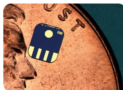
Chip type corrosion sensor

With the need of advanced corrosion sensors, more sophisticated methods have been developed which result in modern corrosion sensors. In every year, a number of corrosion sensors are introduced into the market by researchers. These include novel magnetic corrosion sensing methods and fiber optics based sensing methods, which are more efficient than conventional corrosion sensors (Gupta and Verma, 2009). Superconducting Quantum Interface Devices (SQUIDs), hall sensors and magneto-resistive sensors are examples of magnetic corrosion sensing devices.